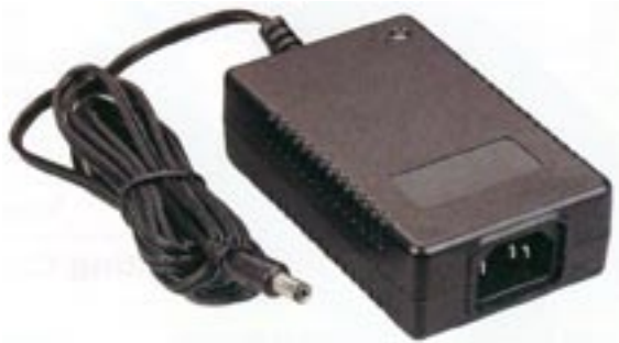
4.2" x 2.6" x 1.2"